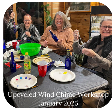
Upcycled Wind Chime Workshop January 2025

We look forward to seeing you at our upcoming activities!