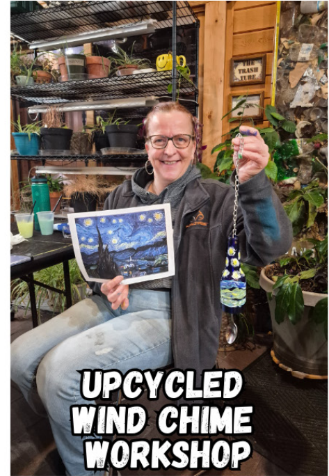
UPCYCLED WIND CHIME WORKSHOP