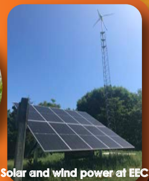
Solar and wind power at EEC