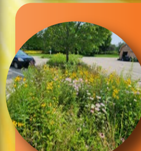
Native plant landscaping in parking lot at EEC

Some of the "easy" places to start include implementing solar power, switching to electric vehicles, and transitioning to native plant landscaping. We look forward to working with each department to find what works best for their needs.