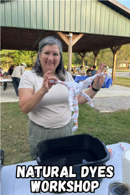
NATURAL DYES WORKSHOP