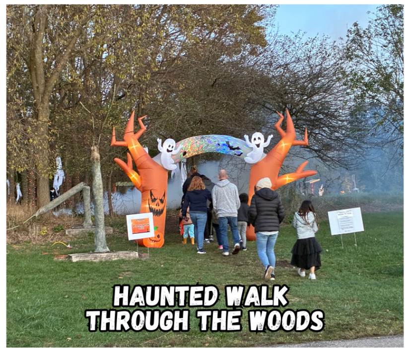
HAUNTED WALK THROUGH THE WOODS