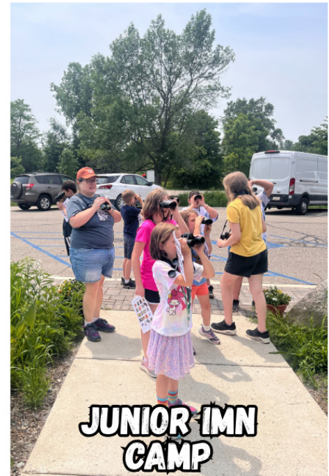
JUNIOR IMN CAMP