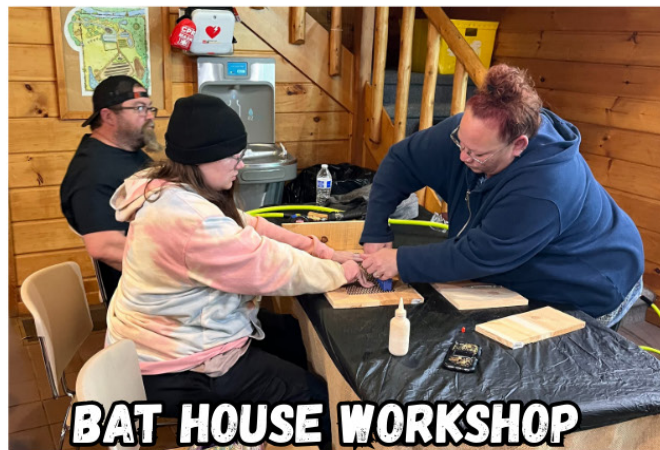
BAT HOUSE WORKSHOP