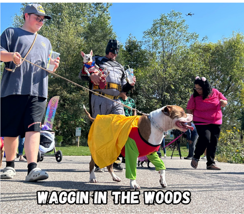
WAGGIN' IN THE WOODS