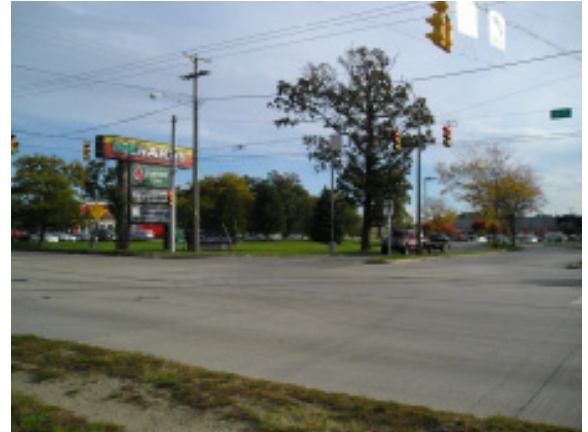
The intersection of Windsor Avenue and Cassopolis Street.

The area surrounding Emerson Drive on the west and Arlington Street on the east contains large areas that are poised for redevelopment. Currently, Emerson Drive and Arlington Street are not in alignment and form T intersections at Cassopolis Street. This results in numerous traffic accidents as people try to jog from one to the other. Further development will only exacerbate this problem. It is imperative that Emerson Drive and Arlington Street be aligned with each other and the intersection signalized. Access to new commercial areas can then be provided from Emerson Drive and Arlington Street. Street improvements along Arlington will be made from Cassopolis Street to CR 9 (Johnson Street) and along CR 9 where new development occurs. Corridor Study recommendations will be implemented and streetscape improvements will be made.