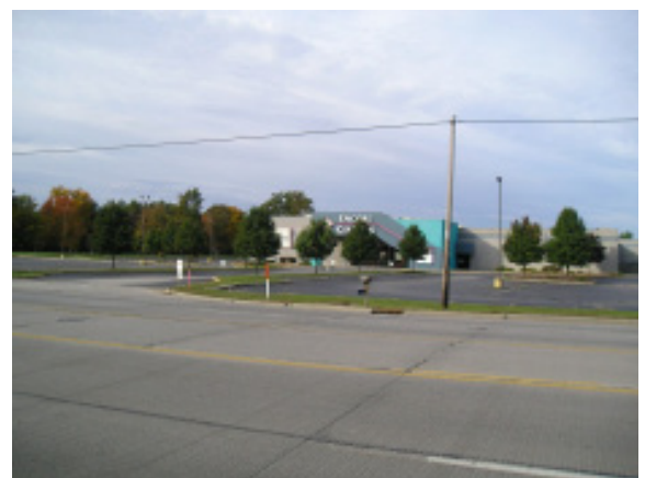
The intersection of Arlington Road and Cassopolis Street.