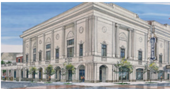
Artist rendering of the Lerner Performing Arts Center.