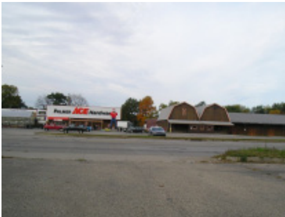
View along Cassopolis Street north of Sunset Avenue.