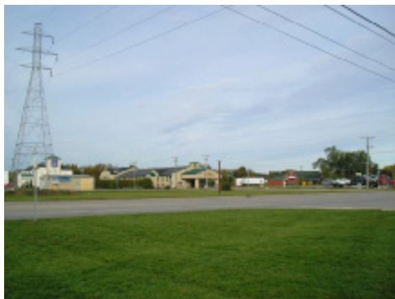
Northpointe Gateway area.

The intersection of Cassopolis Street and the Indiana Toll Road forms a major gateway to the City of Elkhart. It is commonly known as Northpointe due to the presence of the Northpointe PUD, a large mixed-use PUD that occupies the entire corridor west of Cassopolis Street between Sanford School Road and the Toll Road. The area on both sides of the Toll Road and both sides of Cassopolis Street forms a visitor's first impression of Elkhart when exiting the Toll Road. There are many hotels