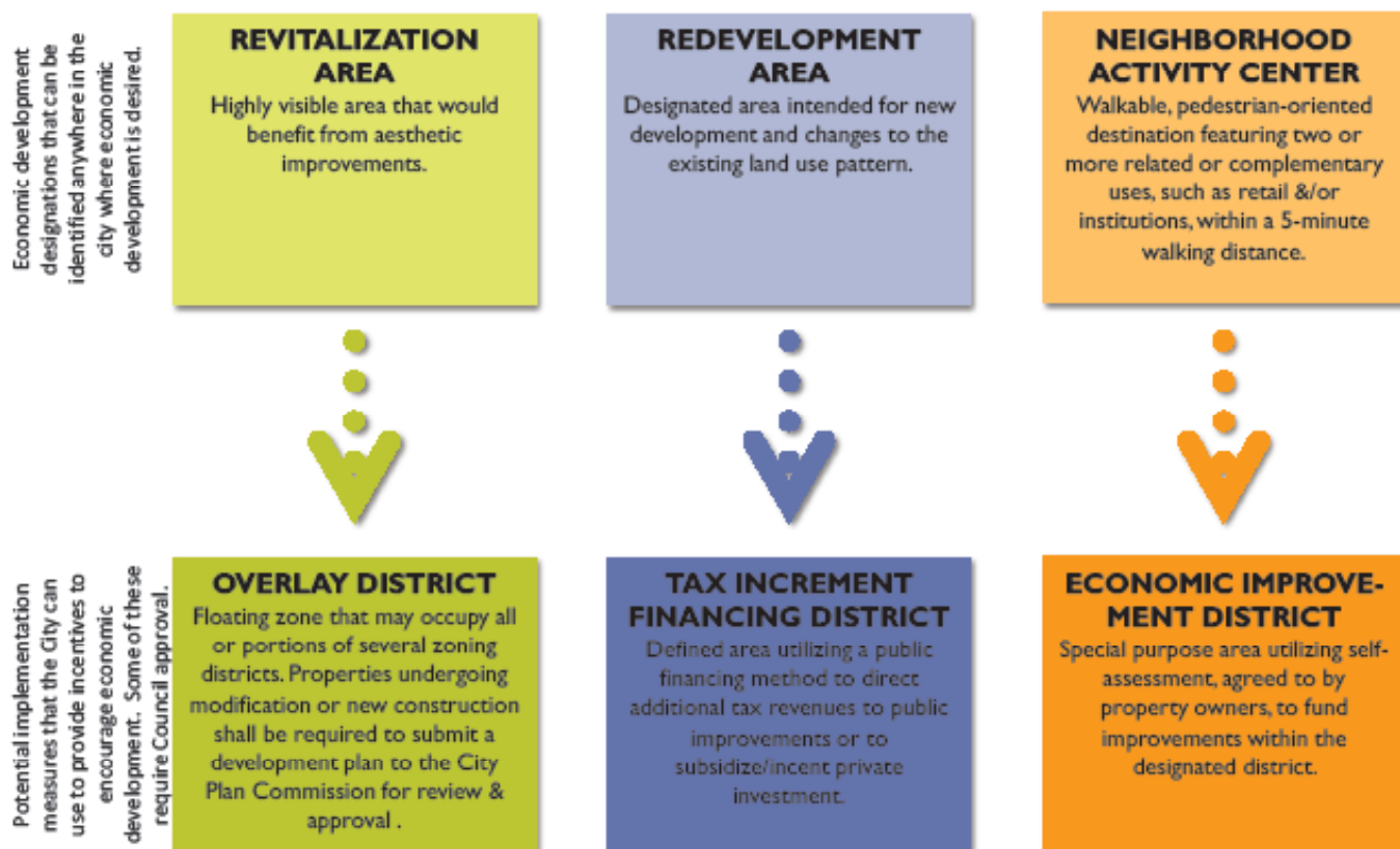
Economic development areas and potential implementation actions.