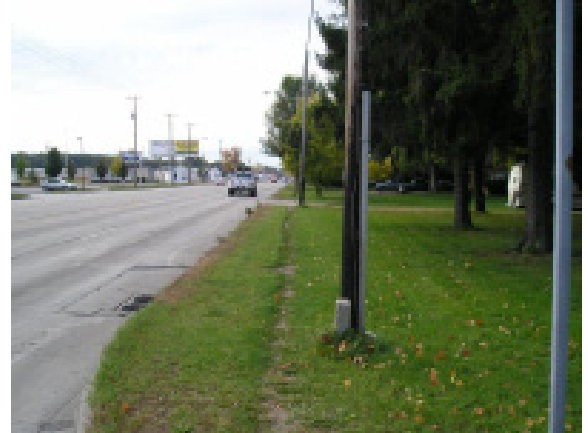
There is a need for better sidewalks along Cassopolis Street.

A major component of the streetscape is landscaping. A unified landscape plan is necessary so that as the corridor develops, the