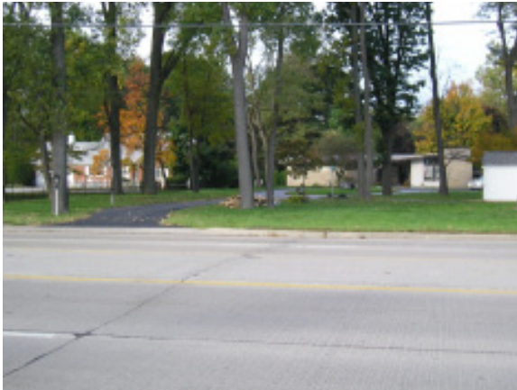
Homes along Cassopolis Street just south of South Drive.